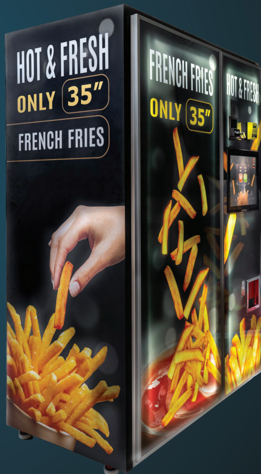
MODEL SARATOGA IS SHOWN ON THE PICTURE